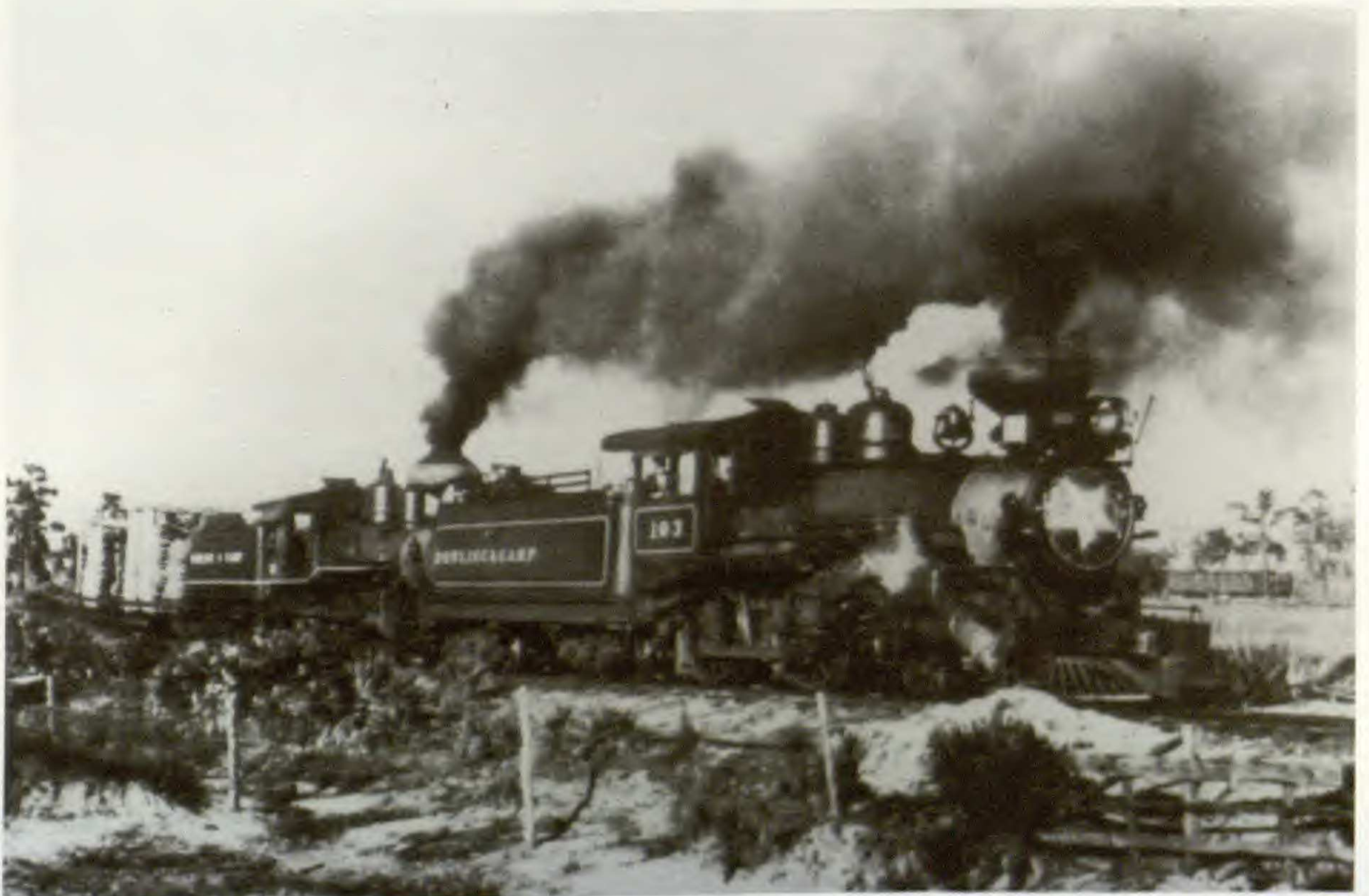
FIGURE 4.—Dowling & Camp's Engine 103 hauled pine logs from the Hickey's Creek operation to the mill at Slater.

As soon as an area was "cutover," rail crews picked up the iron spurs and re-laid them in new, uncut areas of forest (Garner in Walker et al. 1996:Appendix D; Zeiss 1983:102). The railroads and their rail spurs, even when taken up, left visible grades, especially in south Florida where beds often were raised to avoid the sea-